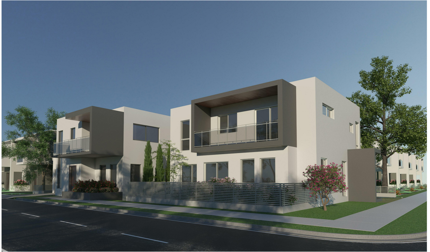
LOT 27 A – 256sq. – DS –SG